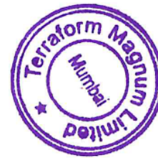
UDAY KUVERJI MOTA